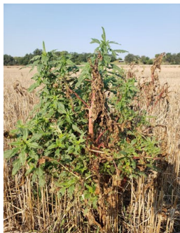
Figure 1. This large Palmer amaranth is regrowing after being sprayed with paraquat.

When thinking about weed control in wheat stubble, there are two priorities – controlling already emerged weeds and preventing later flushes. Making applications before weeds exceed 4 to 6 inches is necessary for good control of already emerged weeds (Figure 1). Residual herbicides are needed to reduce the number of herbicide applications needed to control multiple flushes of weeds.